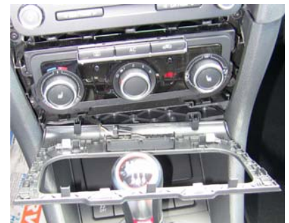
GTI & Golf 10-11 climate control bezel