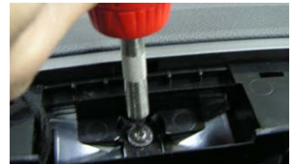
Torx screw to remove shroud