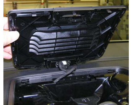
Upper air vent removal

INSTALLATION IS NOW COMPLETE. ENJOY YOUR NEW INDASH by PANAVISE MOUNT.