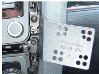
GTI & Golf in place, see detail below