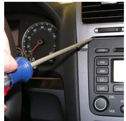
Flat screwdriver pry location to release plastic clip