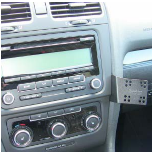
GTI & Golf 10-11 Final Installation Picture

STEP #3: Carefully replace the (2) bezels.