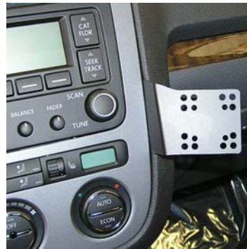
EOS 2007 Final Installation Picture

STEP #3: Place the InDash by PanaVise Mount over screw holes and replace screw. Replace the bezel.