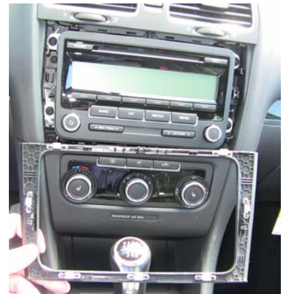
GTI & Golf 10-11 radio bezel