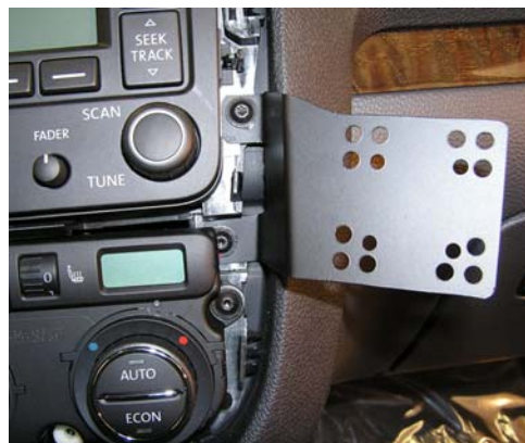
InDash installed showing location