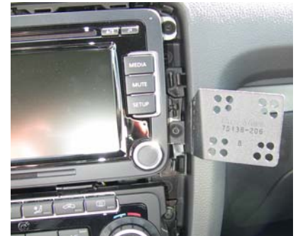
EOS 07-11 Mounting screw locations Climate Controls vary. 2011 above.