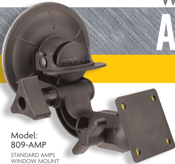
Model: 809-AMP STANDARD AMPS WINDOW MOUNT

THE AMPS HOLE PATTERN IS AN INDUSTRY STANDARD HOLE CONFIGURATION.