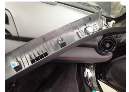
A-Pillar bezel removal