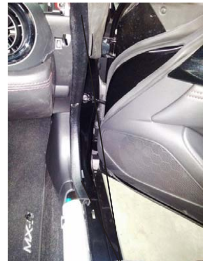
Rubber Molding to Remove