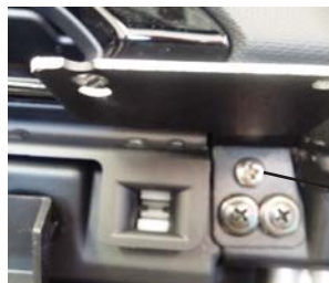
Screw Nut Install Location