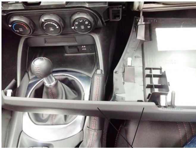
Large Dash Bezel

INSTALLATION IS NOW COMPLETE. ENJOY YOUR NEW PANAVISE INDASH MOUNT.