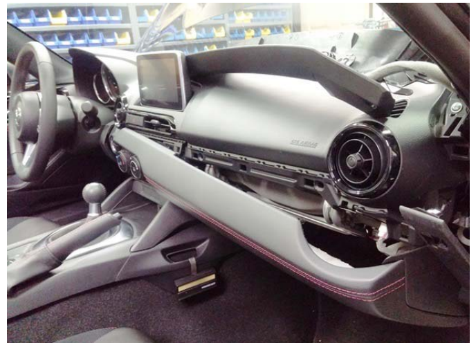
Large Dash Bezel