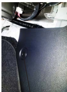
Center Plug to Remove