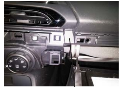
Mounting location for InDash

STEP #7 Install mount Top 75002 onto InDash bottom piece with 2 8-32 accorn nuts.