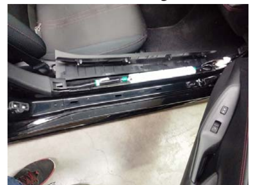
Bottom Door Jam bezel Removal