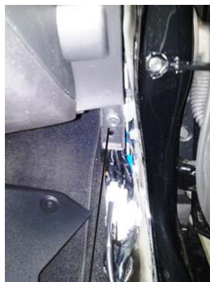
10mm bolt and bezel