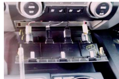
Bezel below CC removal

INSTALLATION IS NOW COMPLETE. ENJOY YOUR NEW INDASH by PANAVISE MOUNT.