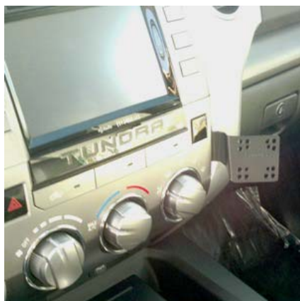
Final InDash install picture