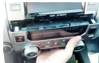
Climate Control removal