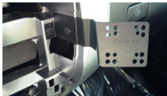
InDash installed showing location